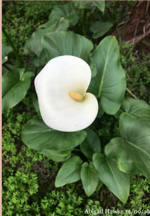
Abigail Hawke 14/09/19