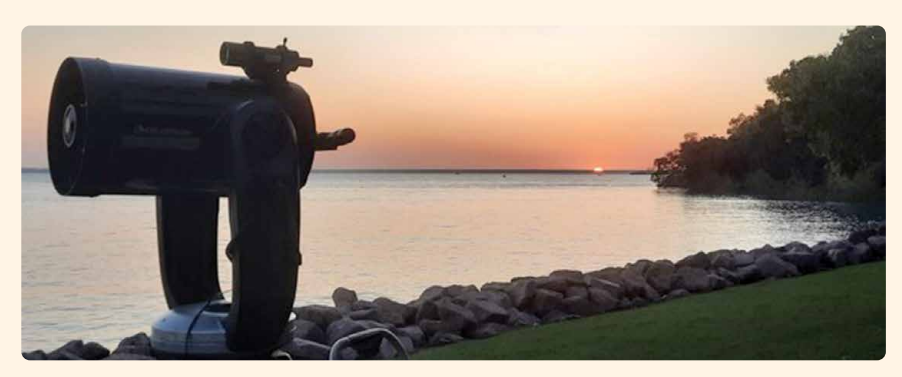
Telescope set up along the Darwin waterfront for viewing by all