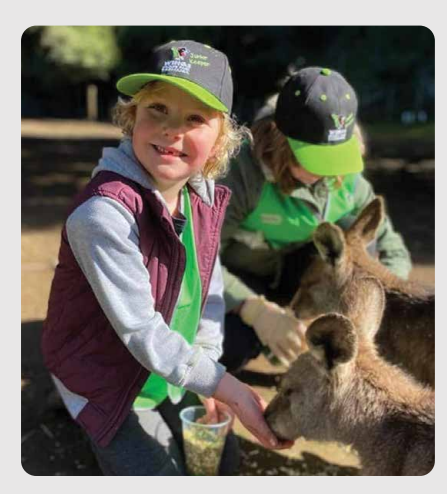
Participating in the Junior Ranger experience

'The park experienced some devastating flooding last year. One of our Junior Rangers was so upset by this that he arranged a fundraiser through