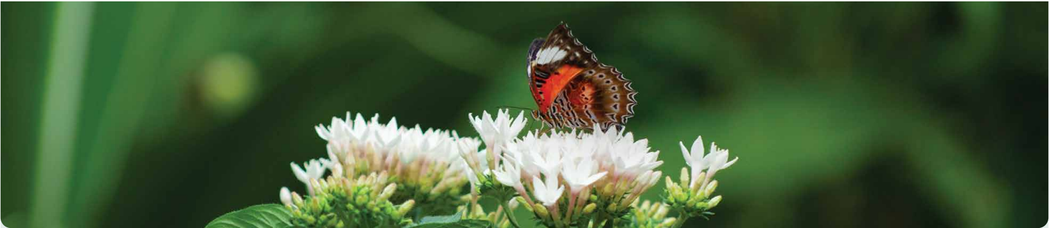
Top: Inside the lush aviary at the Australian Butterfly Sanctuary | Photo: Australian Butterfly Sanctuary Bottom: Red Lacewing butterfly, a local Queensland species | Photo: Australian Butterfly Sanctuary