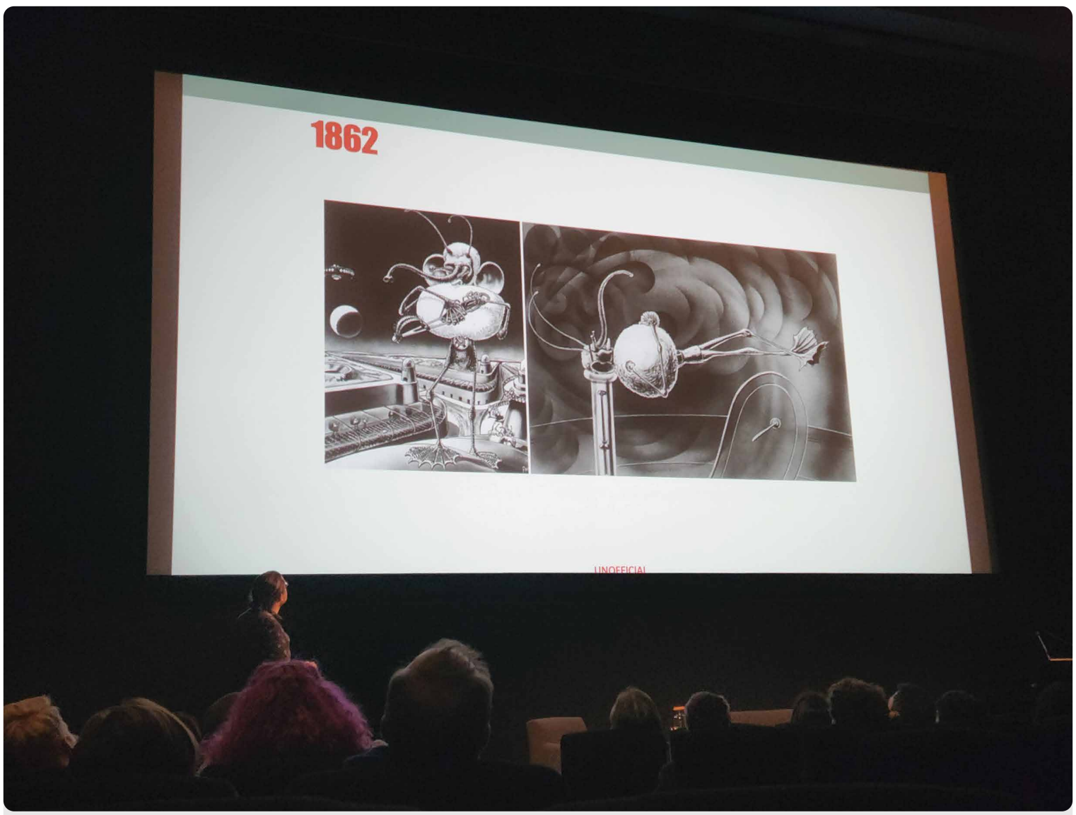
Live presentation accompanied the film screening