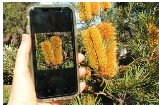
Plant identification app